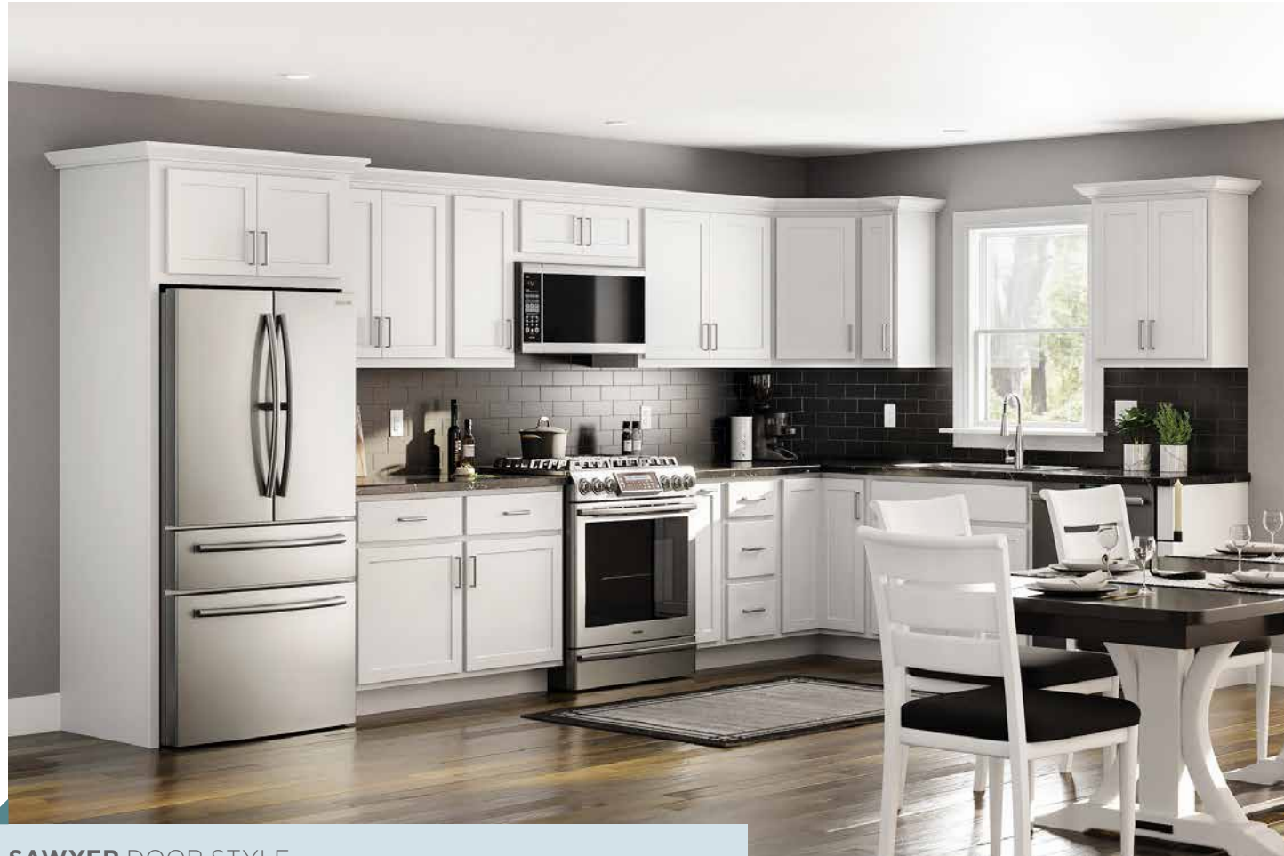
SAWYER DOOR STYLE

True to its name, Builders Mark™ cabinets offer designers, contractors, and builders ample design opportunities at an extremely affordable price point. The Tempo series — a collection of four popular finish options — is our renewed commitment to bringing you pocket-friendly style that you can trust.