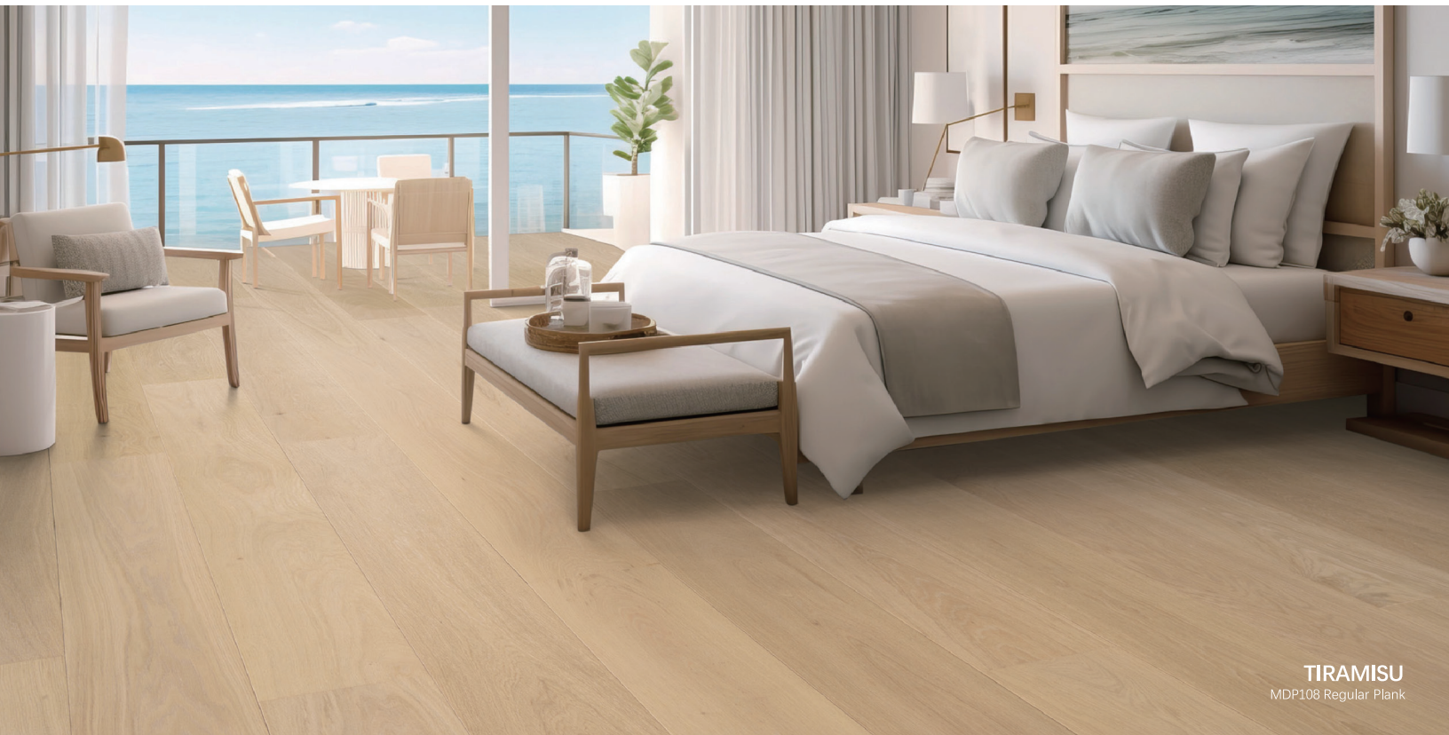
TIRAMISU MDP108 Regular Plank

The MADERA Collection presents a curated selection of modern hues, each crafted for the pinnacle of luxury. Spanning an impressive 9.5 inches in width and 86.6 inches RL in length, our French White Oak planks undergo a rigorous multi-stage crafting process. The result is exceptional style flooring, poised to invigorate your living space and elevate the ambiance of sophisticated gatherings.