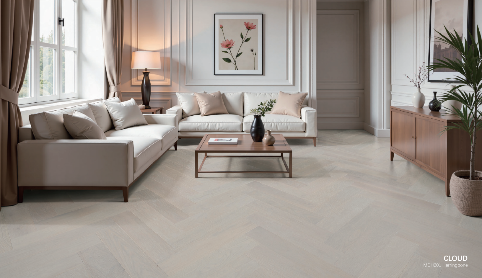
CLOUD MDH201 Herringbone