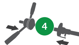
Park Tool™ HHP-2

3 HAND PRESS Von Hand Einpressen Apretar Con La Mano Enfoncer à la main