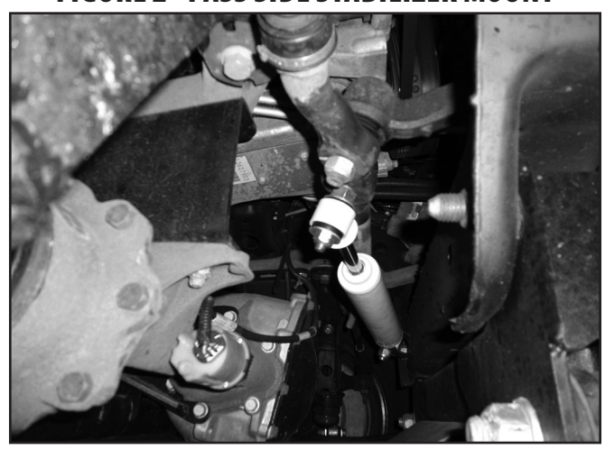
FIGURE 2 - PASS SIDE STABILIZER MOUNT