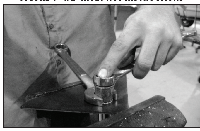
FIGURE 4 - 1/2" RIVET NUT INSTRUCTIONS