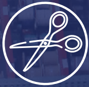
CUT & STRIP