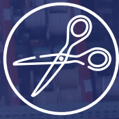
CUT & STRIP