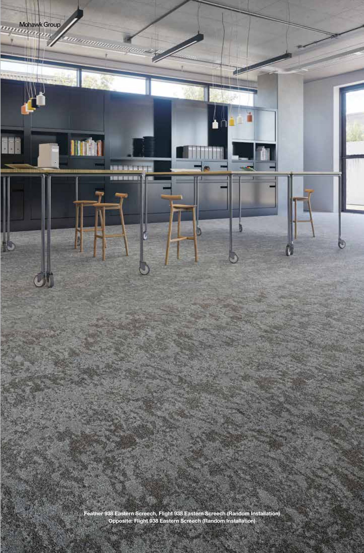
Feather 938 Eastern Screech, Flight 938 Eastern Screech (Random Installation) Opposite: Flight 938 Eastern Screech (Random Installation)