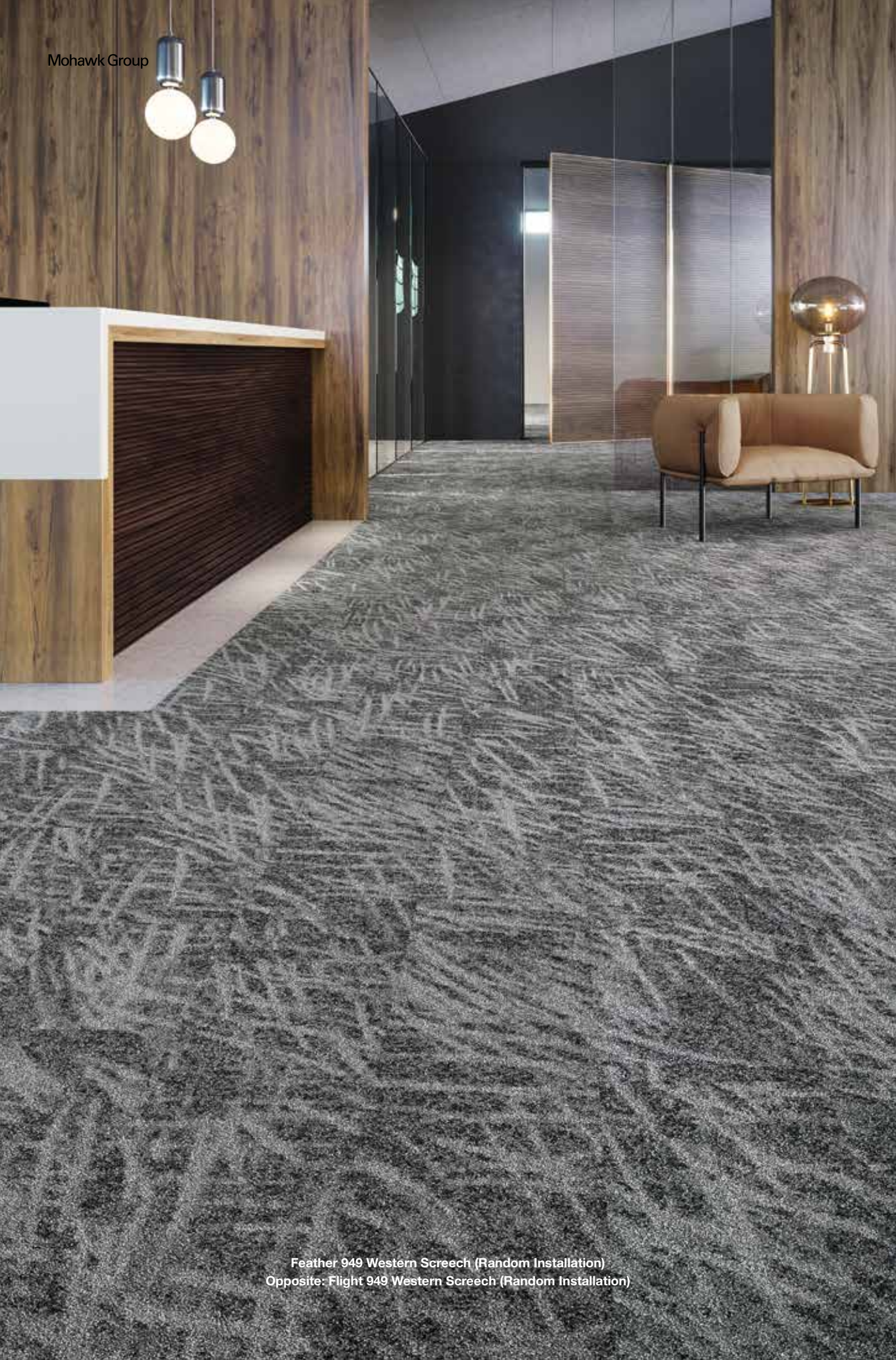
Feather 949 Western Screech (Random Installation) Opposite: Flight 949 Western Screech (Random Installation)