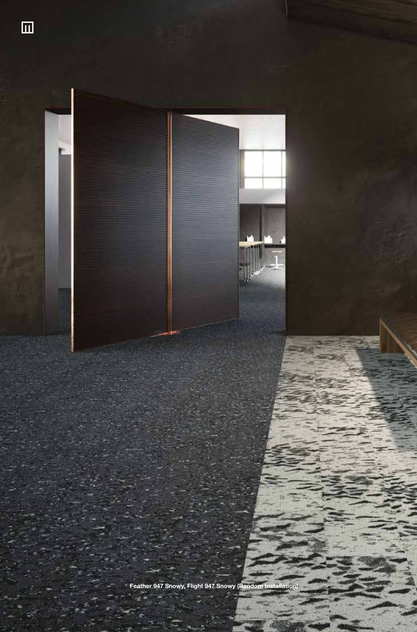
Feather 947 Snowy, Flight 947 Snowy (Random Installation)