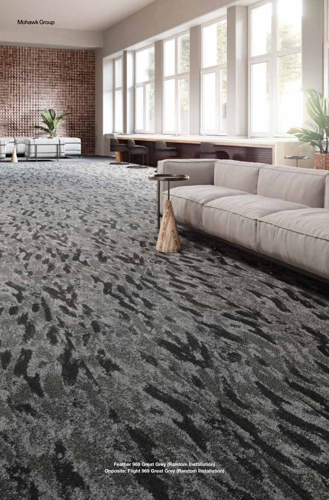
Feather 969 Great Grey (Random Installation) Opposite: Flight 969 Great Grey (Random Installation)