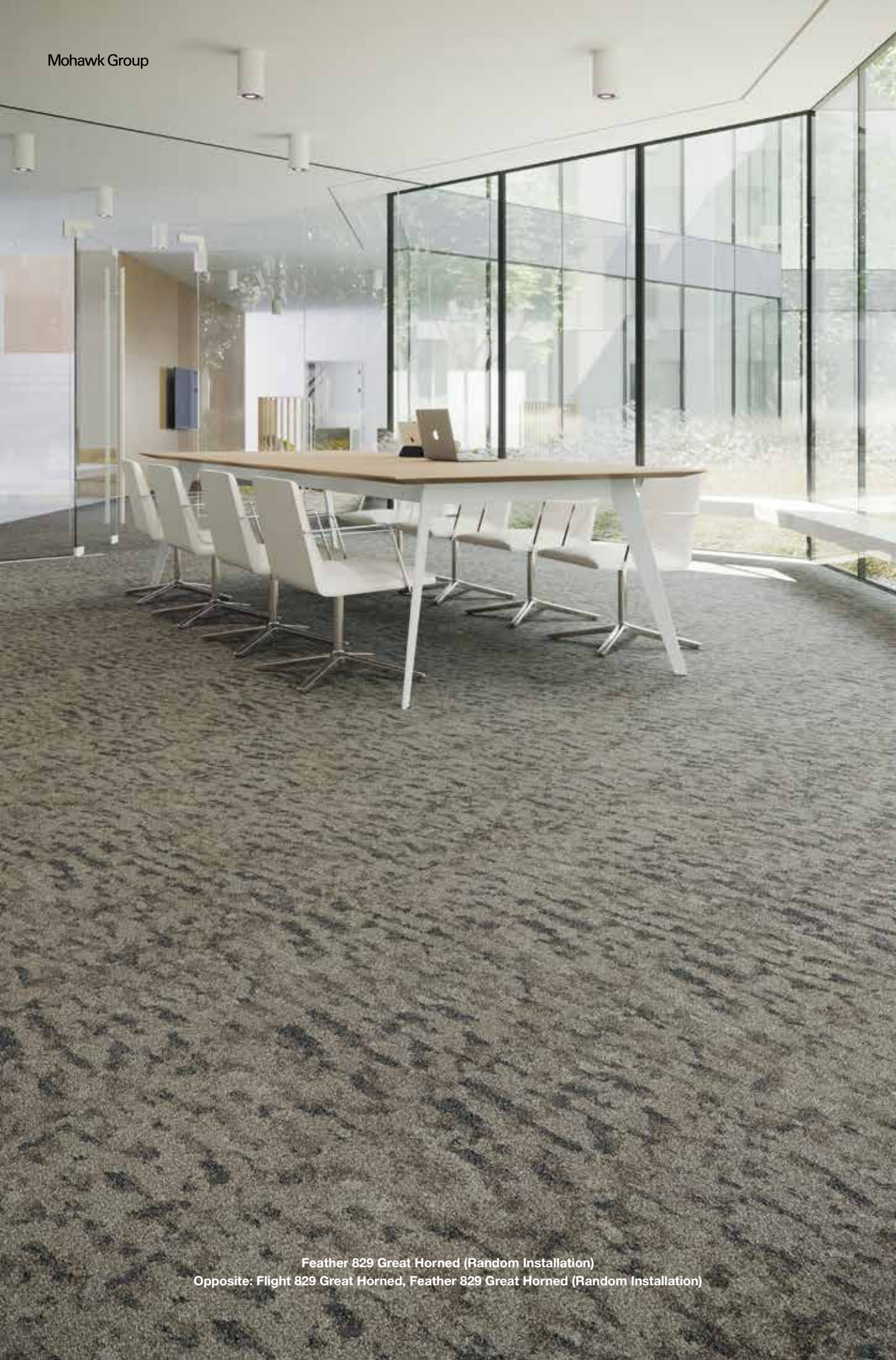
Feather 829 Great Horned (Random Installation) Opposite: Flight 829 Great Horned, Feather 829 Great Horned (Random Installation)