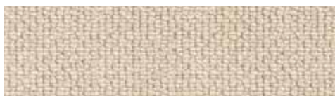
SALISBURY - 10 Sarsen Stone

This colour scheme is ideal for drawing attention to key areas like seating arrangements or bar setups. Bright accents add a sense of fun and energy, while deeper tones ensure the space remains grounded and sophisticated. It's an easy way to create an atmosphere that is both stylish and approachable, while enjoying a lively ambiance.