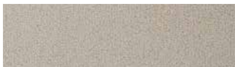
HAMMERSMITH - 4 Ravenscourt