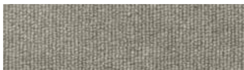
13TH BEACH - 12 Ants