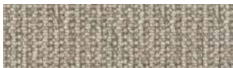
OPULENT WEAVE - 12 Cashmere