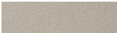
HAMMERSMITH - 4 Ravenscourt