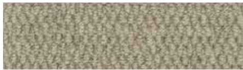
GREAT DIVIDE - 43 Bogong