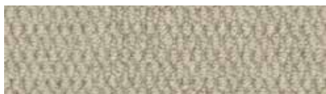
GREAT DIVIDE - 41 Howitt