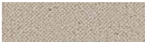
SPINIFEX - 13 Earth