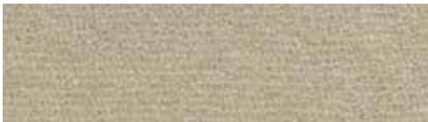
BERKLEY - 41 Bone