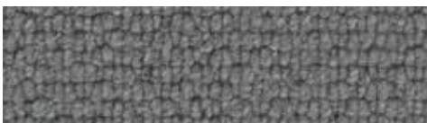
SALISBURY - 93 Stone Lintel