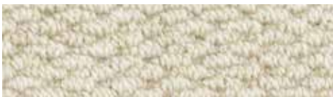
GREAT DIVIDE - 1 Feathertop