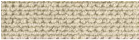
BARLEYSTONE - 1 Grasscloth

In an age dominated by technology, natural tactility offers a counterpoint that encourages physical engagement and a break from digital saturation. Interiors designed with this trend in mind serve as sanctuaries from the high-paced, screen-focused lifestyle.