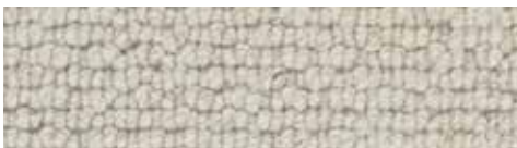
SALISBURY - 11 Druid Stone