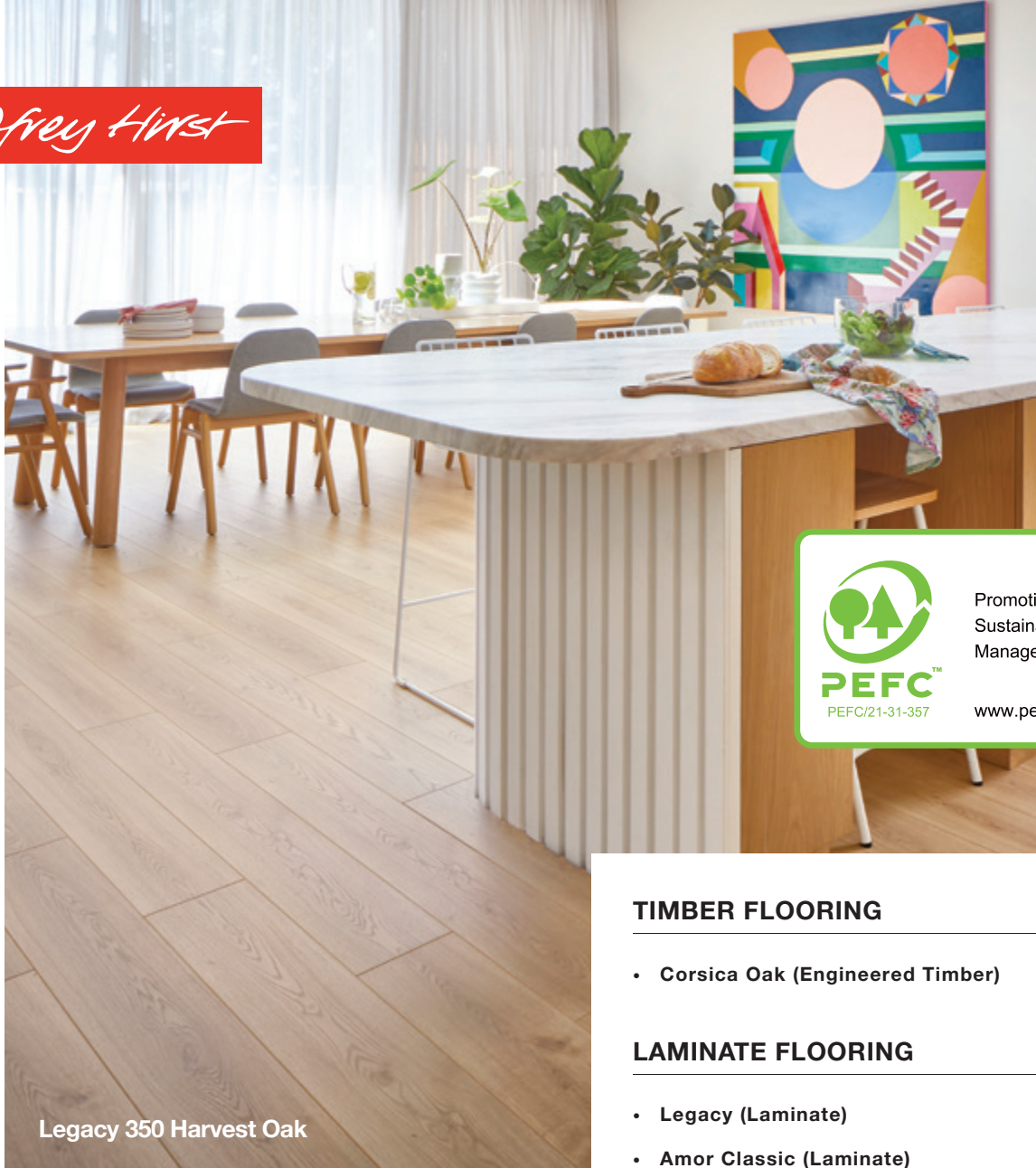
Legacy 350 Harvest Oak