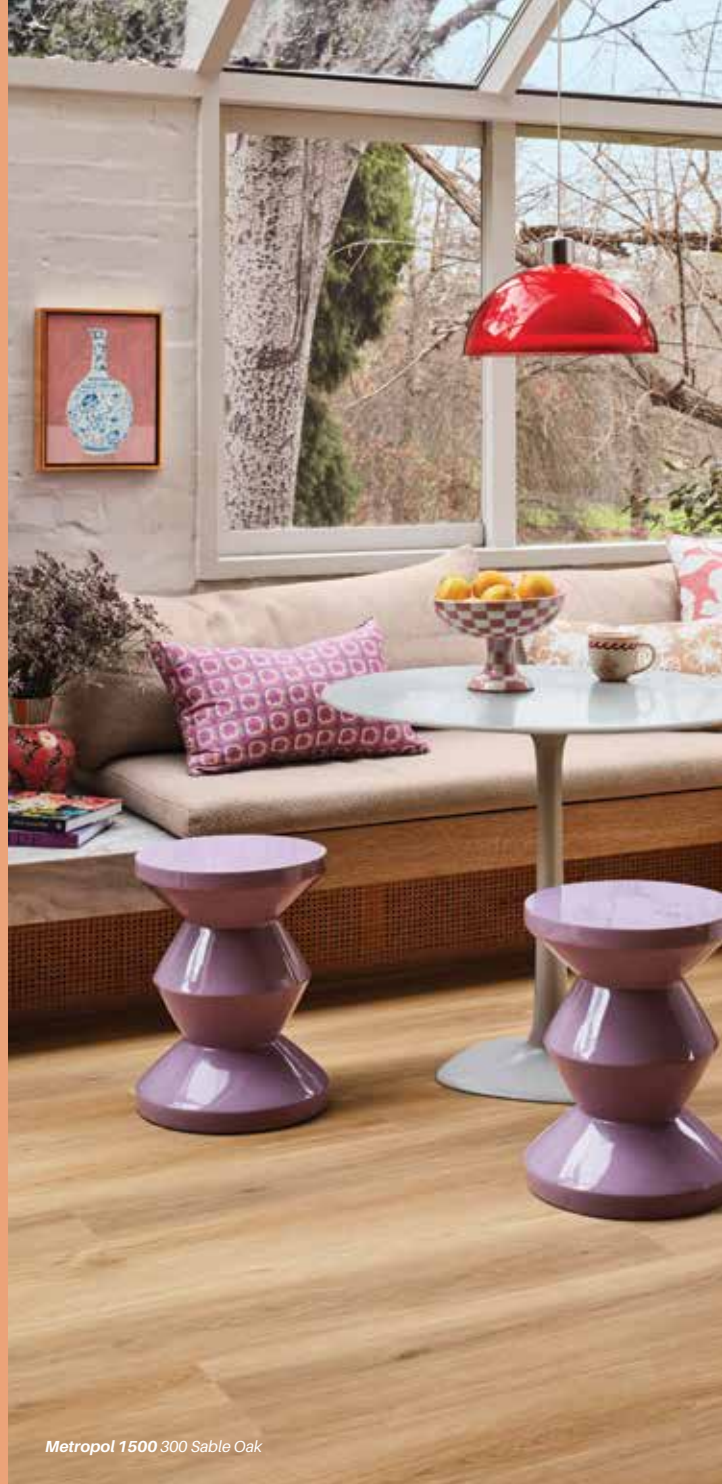
Metropol 1500 300 Sable Oak

The Quirky Pastels trend is a playful and creative take on traditional pastel hues. Inspired by romantic pastels and vivid mid-tones, this trend incorporates a craft-driven approach to interior design.