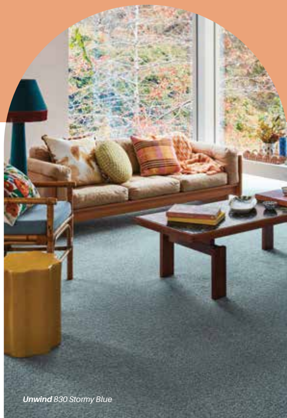
Unwind 830 Stormy Blue

A playful and creative take on traditional pastel hues.