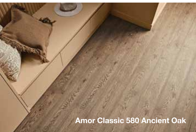
Amor Classic 580 Ancient Oak

The PEFC CoC tracks forest-based products from source to market, requiring all companies along the supply chain to be certified by third party, and providing independent assurances that any forest-based products certified originate from a sustainably managed forest.