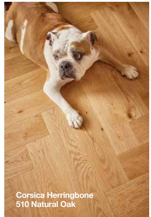
Corsica Herringbone 510 Natural Oak