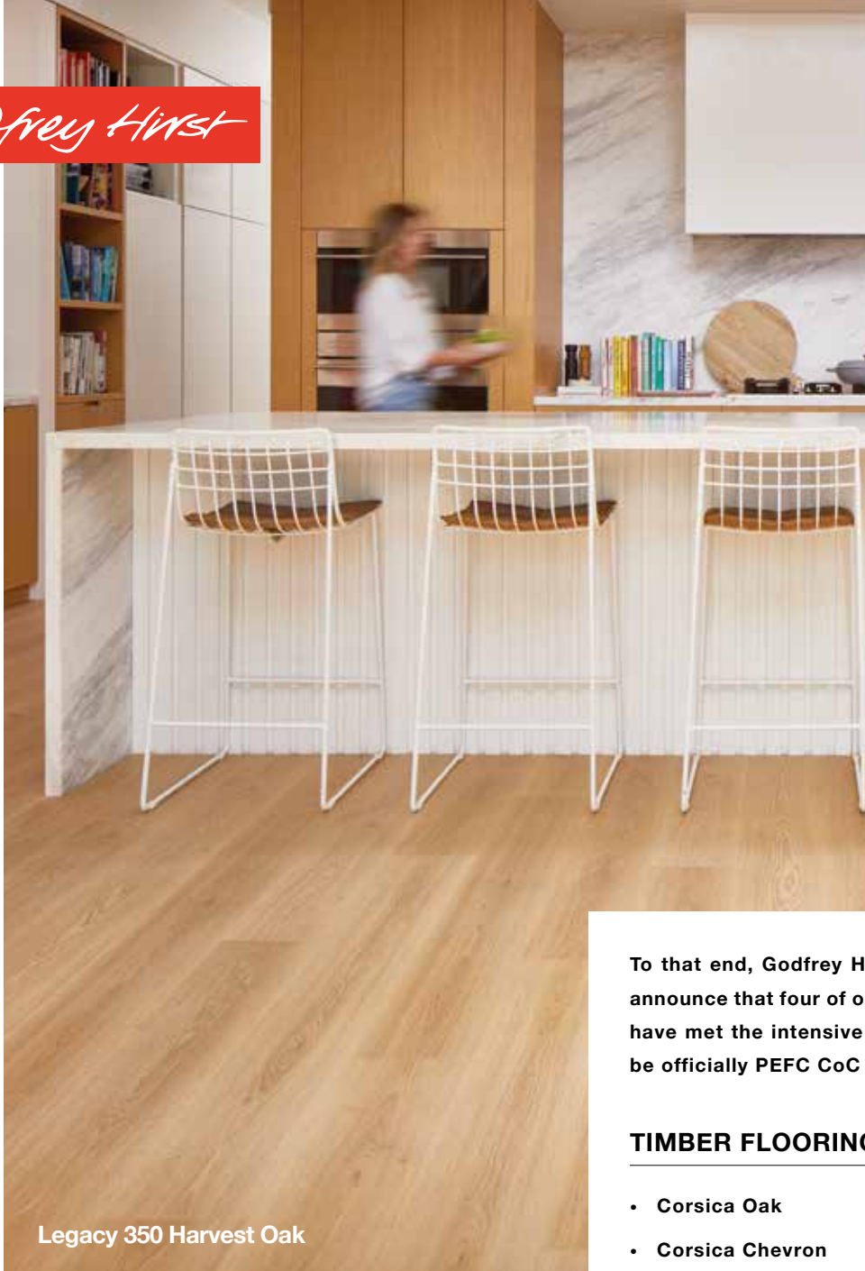
Legacy 350 Harvest Oak