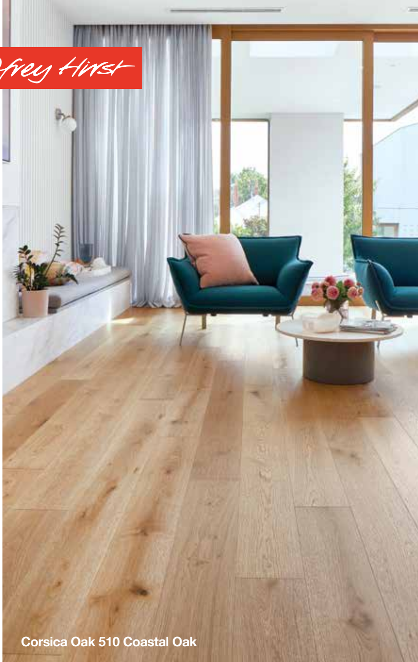
Corsica Oak 510 Coastal Oak