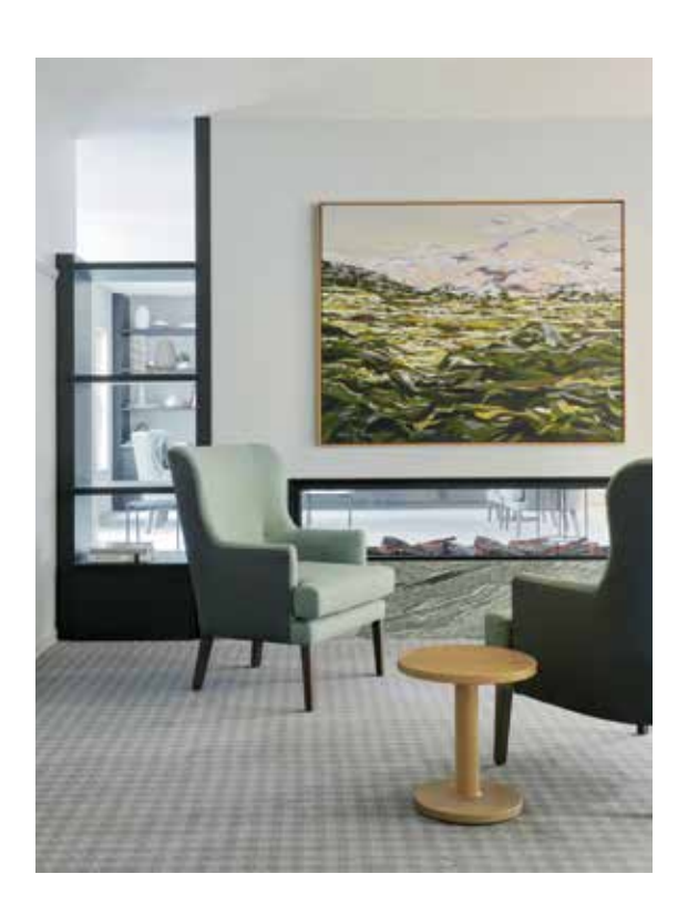
Eva Tilley Memorial Home

The schedule should provide for recording of actual work, done and by whom it is performed, and shall be maintained for reference should any cleaning problems arise. The schedule should be amended as necessary when there is a significant change in the pattern of use of any area.