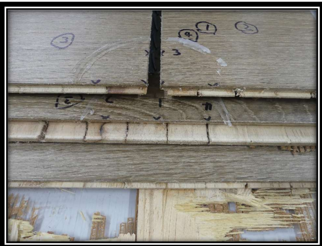
Recovered Swell (Disassembled)

Samples and their identifying descriptions have been provided by the client unless otherwise stated. NZWTA Ltd makes no warranty, implied or otherwise as to the source of the tested samples. The above results are designed to provide THE CLIENT WITH GUIDANCE INFORMATION ONLY. This document shall not be reproduced except in full.