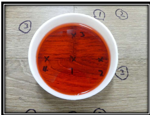
24 Hrs with Water