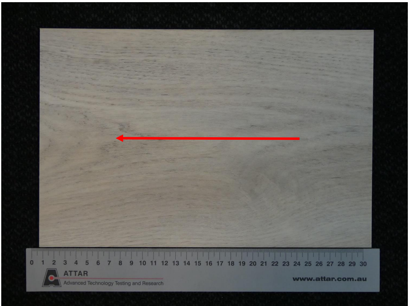
Figure 1: Embossing LVT 58 – Vinyl plank. Arrow indicates direction of test.