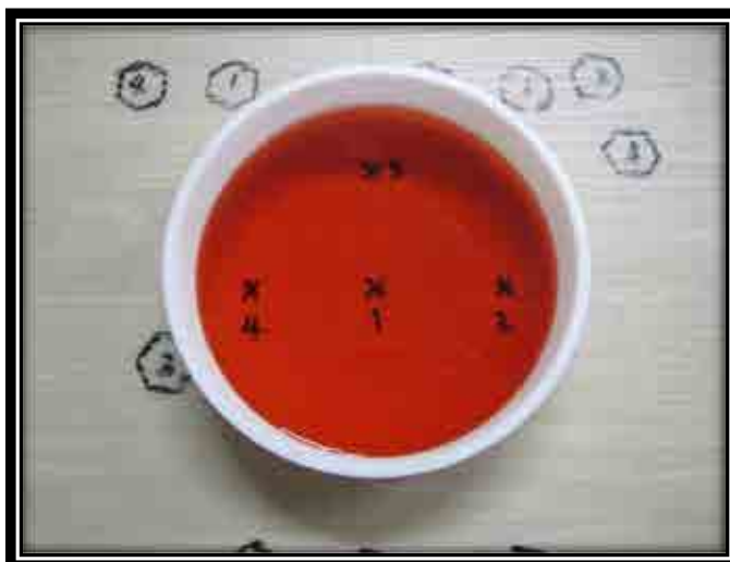
24 hrs With Water