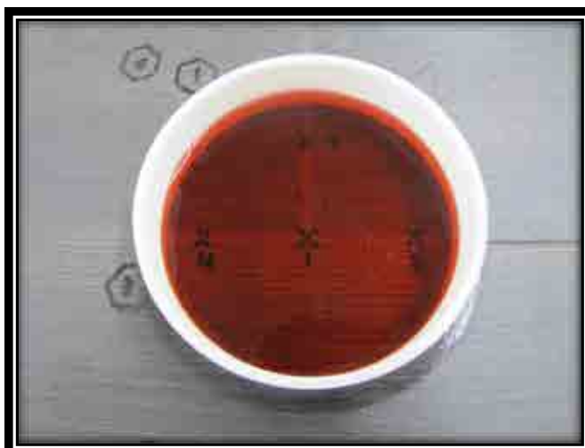
24 hrs With Water