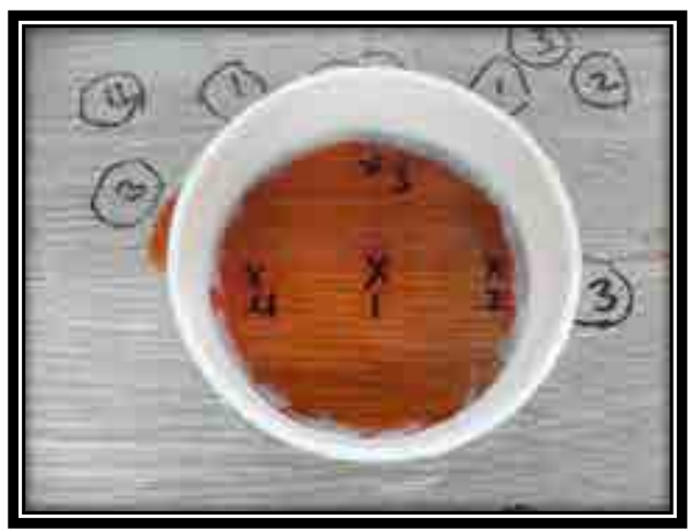
24 hrs With Water (sample 1)