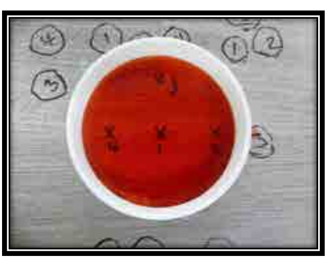
24 hrs With Water