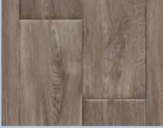
180 Chestnut Oak W84