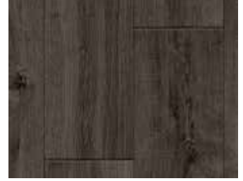
190 Noble Oak W97