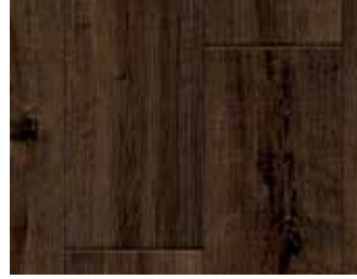
185 Noble Oak W48