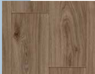
540 Parker Oak W44