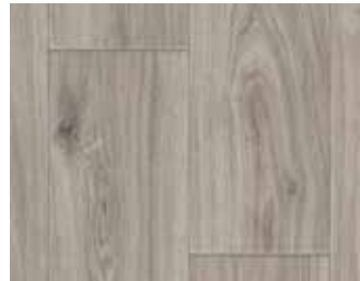
700 Parker Oak W93