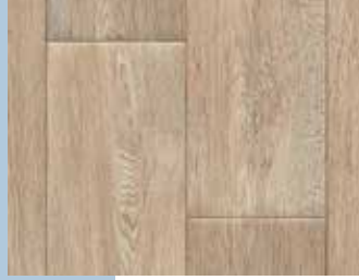
340 Chestnut Oak W35