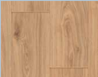
310 Parker Oak W31