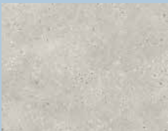
770 Oxley 692