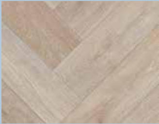
710 Rosario Oak 631