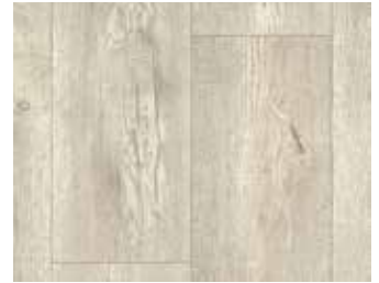
110 Oslo W34