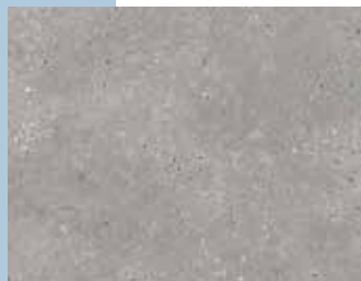
780 Oxley 695