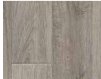
730 Cabral W37