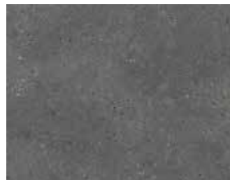
790 Oxley 697