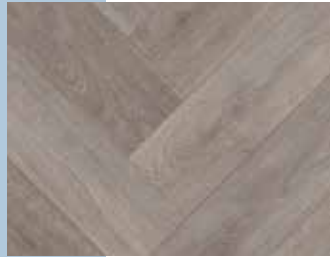
720 Rosario Oak 694