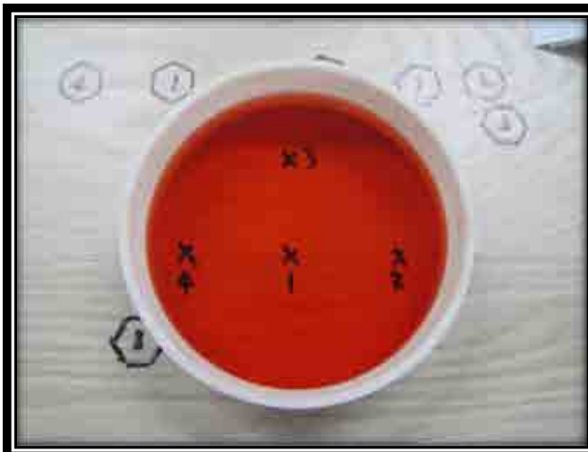
24 hrs With Water