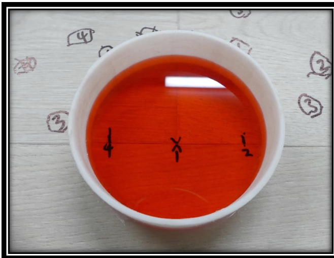
After 24 hrs With Water