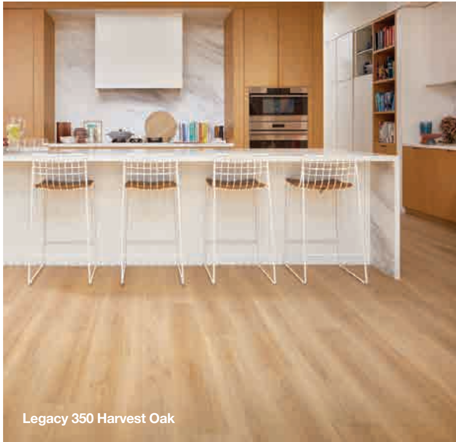
Legacy 350 Harvest Oak

As part of the world's largest flooring manufacturer, we take the social contract of contributing to a healthier environmental future extremely seriously, continually challenging ourselves to design, manufacture and distribute products that are healthier for us and kinder to the planet.