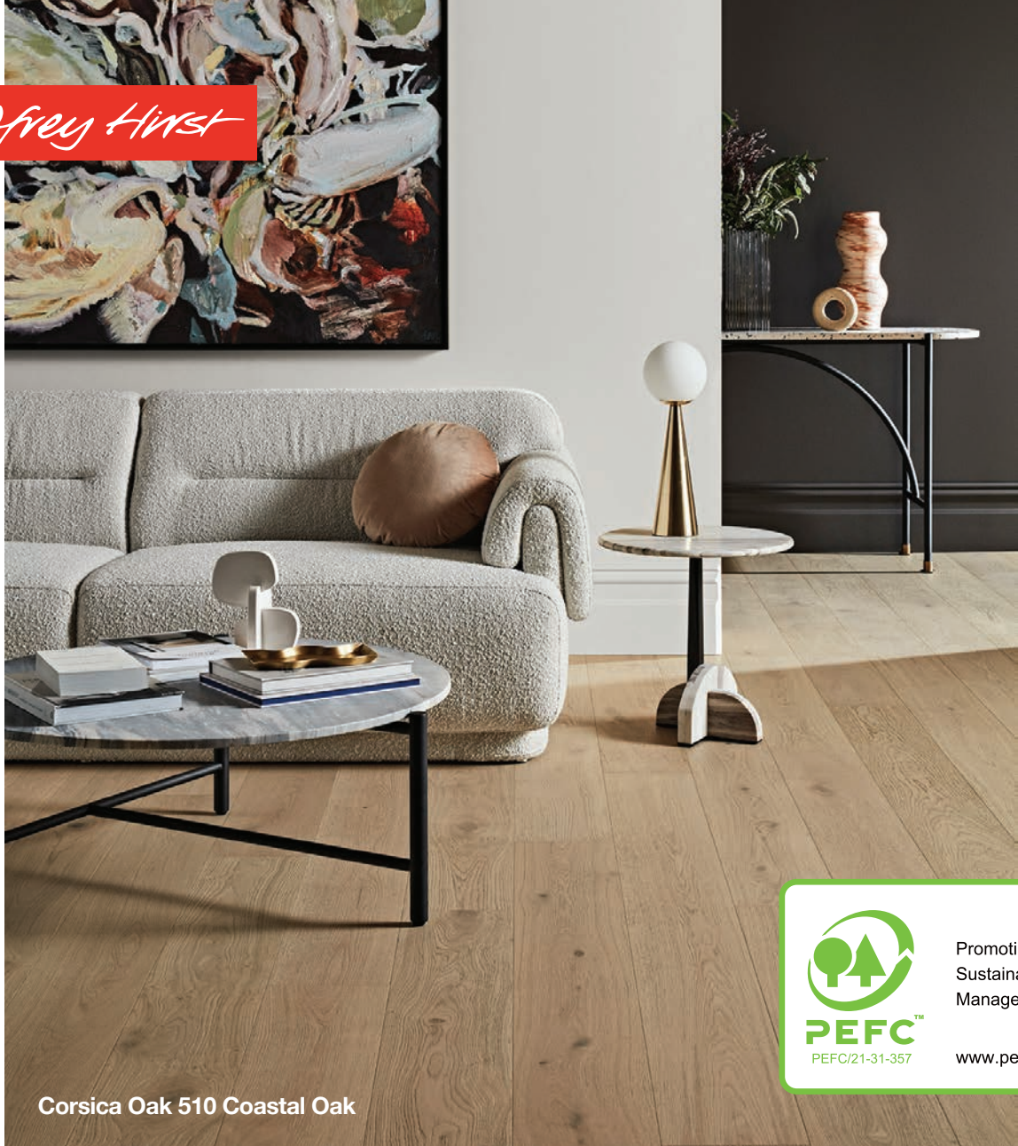
Corsica Oak 510 Coastal Oak