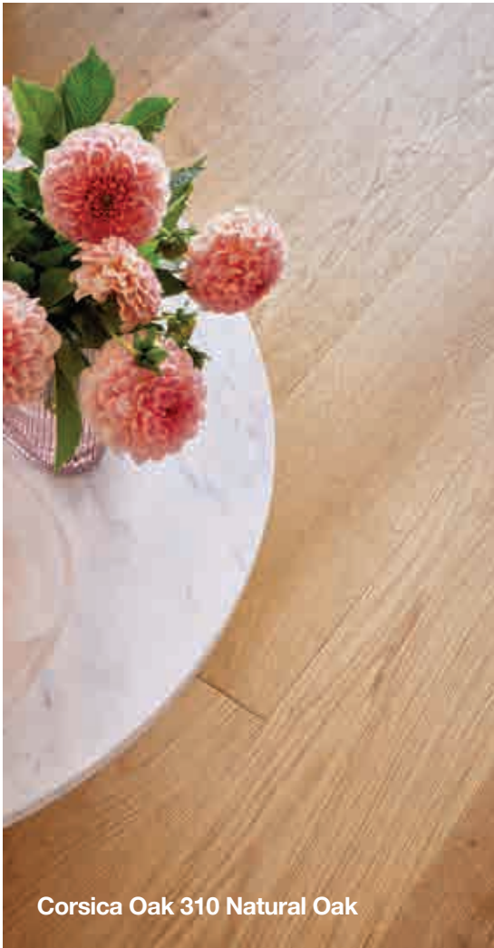
Corsica Oak 310 Natural Oak