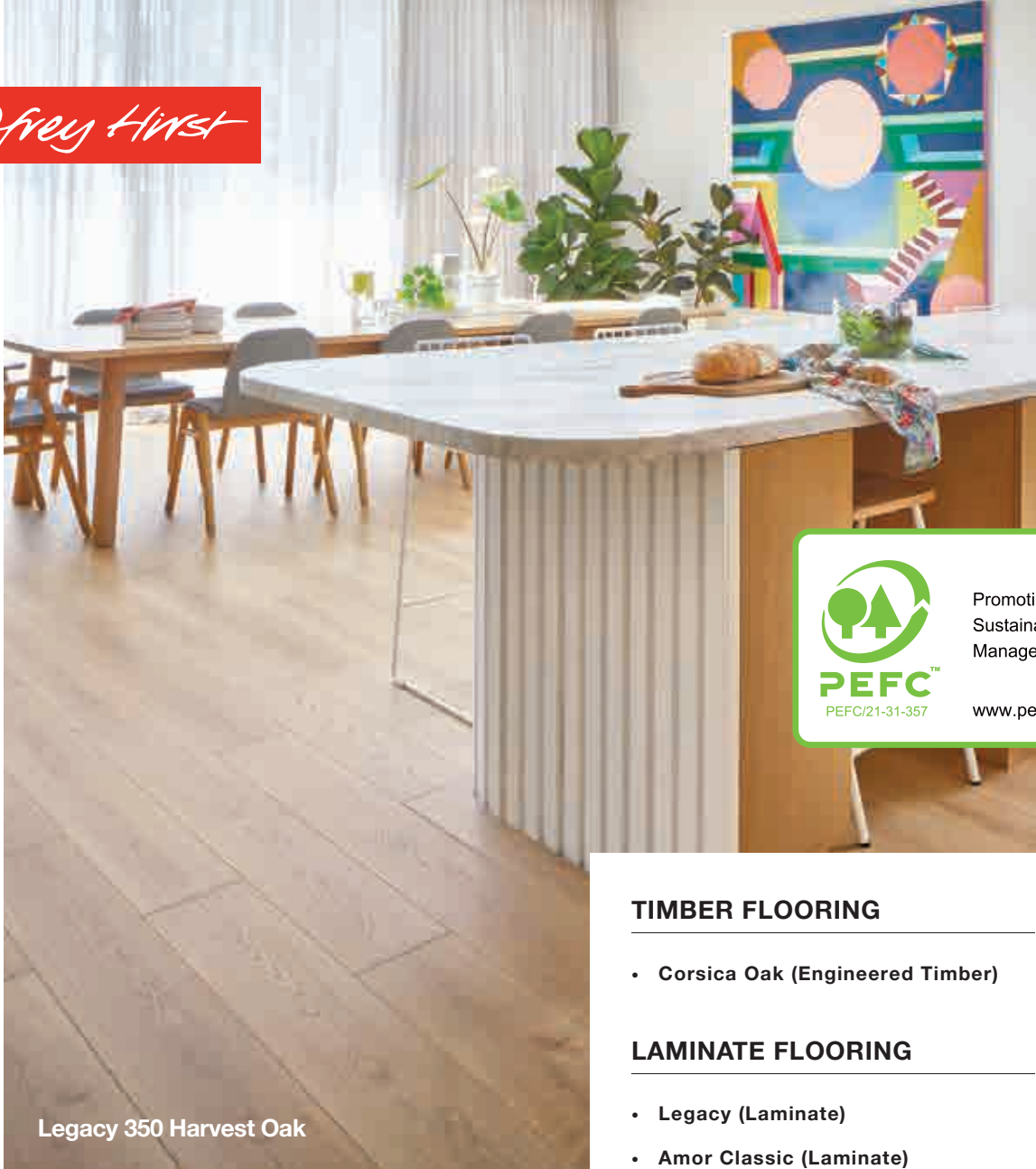
Legacy 350 Harvest Oak