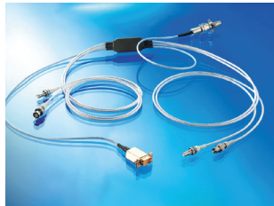
Cabling and Harnessing