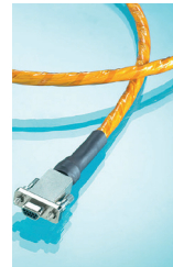
High data rate