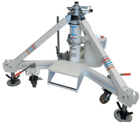
A320/B737 Tripod jack

- TMH-TOOLS : OEM of GSE and tooling, licensee for Boeing and UTC Goodrich, distributor licensee for Messier-Bugatti-Dowty, and also strong partnership with AIRBUS and ATR for more than 30 years.