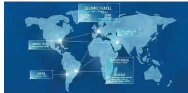
SECAMIC GROUP WORLDWIDE