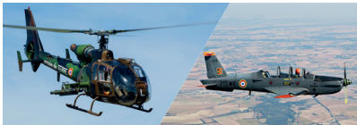
Gazelle + Epsilon