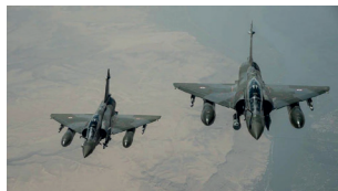
RedAir Mirage 2000