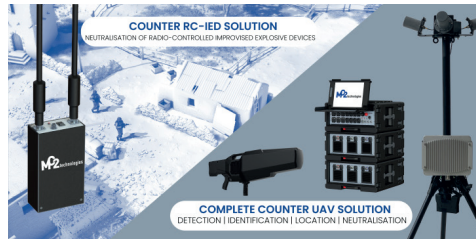
Counter measures for RC-IEDs and UAVs

The french company has been certified ISO 9001 since April 2021 and has a strong will to design, manufacture and produce on French or even European ground. In addition, MC2 Technologies aims at mastering a diversification strategy into dynamic sectors that ensures the company's continued growth concomitantly to its R&D program.