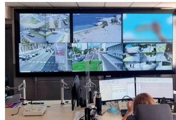
CRISIS MANAGEMENT SOLUTION