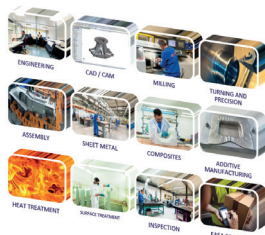
Key notes activities