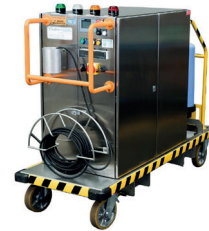
Potable Water Desinfection Unit