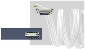
Versatys Connector - Ultra fast connection

Axon' Cable designs and manufactures wires, composite cables, cable assemblies, miniature connectors and mini-systems for high-tech applications. Flexibility, fast integration, weight and space saving, high frequency, high data rate, EMC performance, extreme temperatures, resistance to radiation, these are the qualities of interconnect solutions offered by Axon' for avionics and space applications. For a better sales support in South America, Axon' has set up a subsidiary in Brazil since 2013.