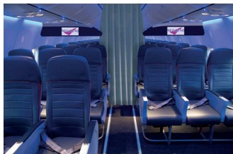
BSI CD on B737NG

Recaero Group offers a range of services including design, certification and manufacturing activities, 100% aeronautical oriented. Recaero experienced design team works in close collaboration with its technical offices strong of over 25 years of experience, to ensure the best technical solution. Thanks to its internal design & manufacturing capabilities, Recaero can offer true design to cost and deliver parts or kits under unmatched lead time. Trusted by many airlines for their STC or minor modifications under our DOA EASA.21J.664. Recaero Group, one stop service offer for modifications & Repairs, Recaero, Your DOA / POA / MOA services provider DOA EASA.21J.664 / POA FR.21G.0181 / MOA FR.145.0756