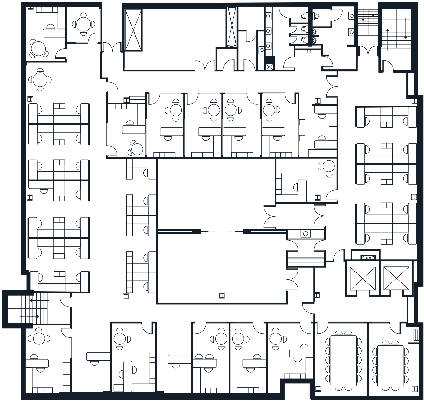
Third floor 9,500 SF