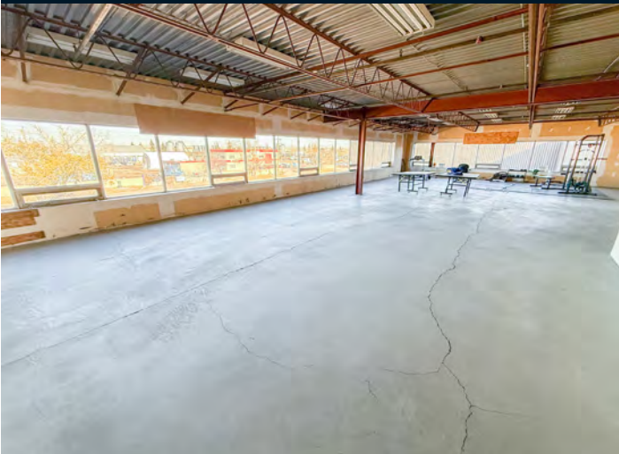
Unit B - Concrete Mezzanine