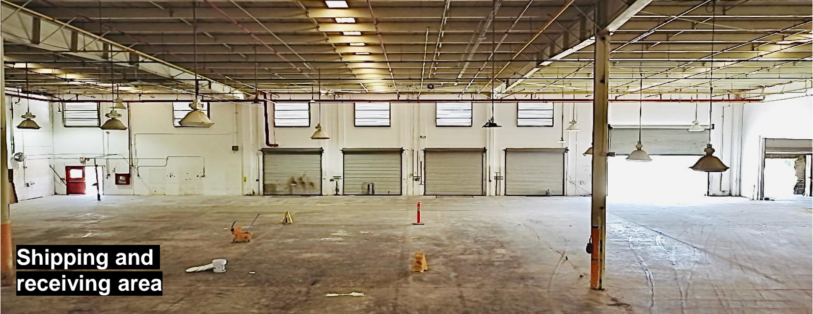
Shipping and receiving area