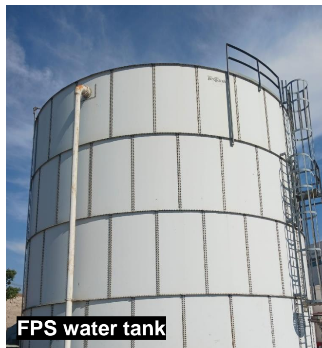
FPS water tank