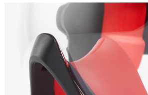
TPE PADDED FRAME