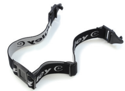
OPTIONAL EASY-CHANGE BUCKLE HEADSTRAP