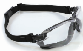
Quadro™ available with adjustable head strap