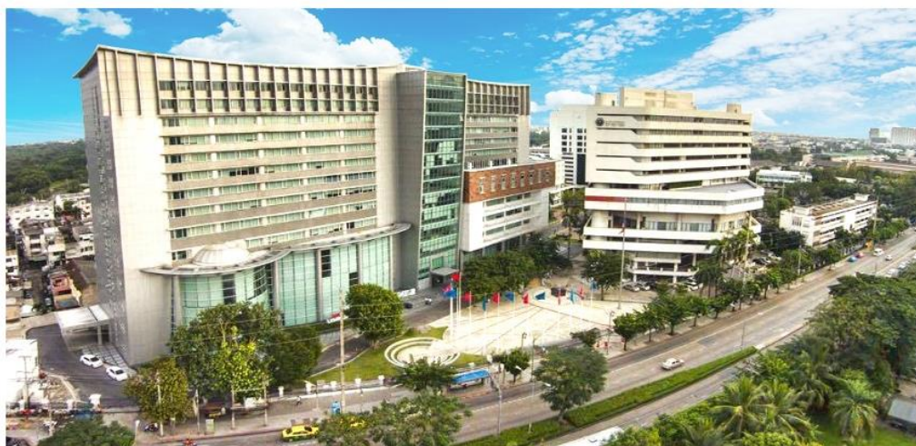
SPU Campus Thailand.