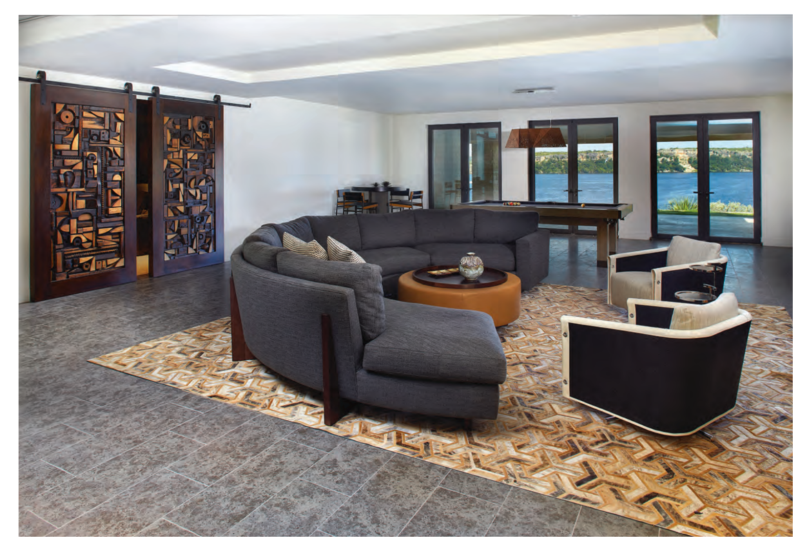
Mabel Hutchinson 1968 vintage wood doors purchased at Los Angeles Modern Auctions (LAMA); Thayer Coggin Cool Clip sofa and ottoman; Lario swivel chairs by Pierantonio Bonacina, Scott + Cooner; Steven Hall for Horm pool table light, plywood ceiling fixture with laser incisions, Scott + Cooner; hair-on-hide rug, Truett Fine Carpets and Rugs; Shetland grey limestone flooring.