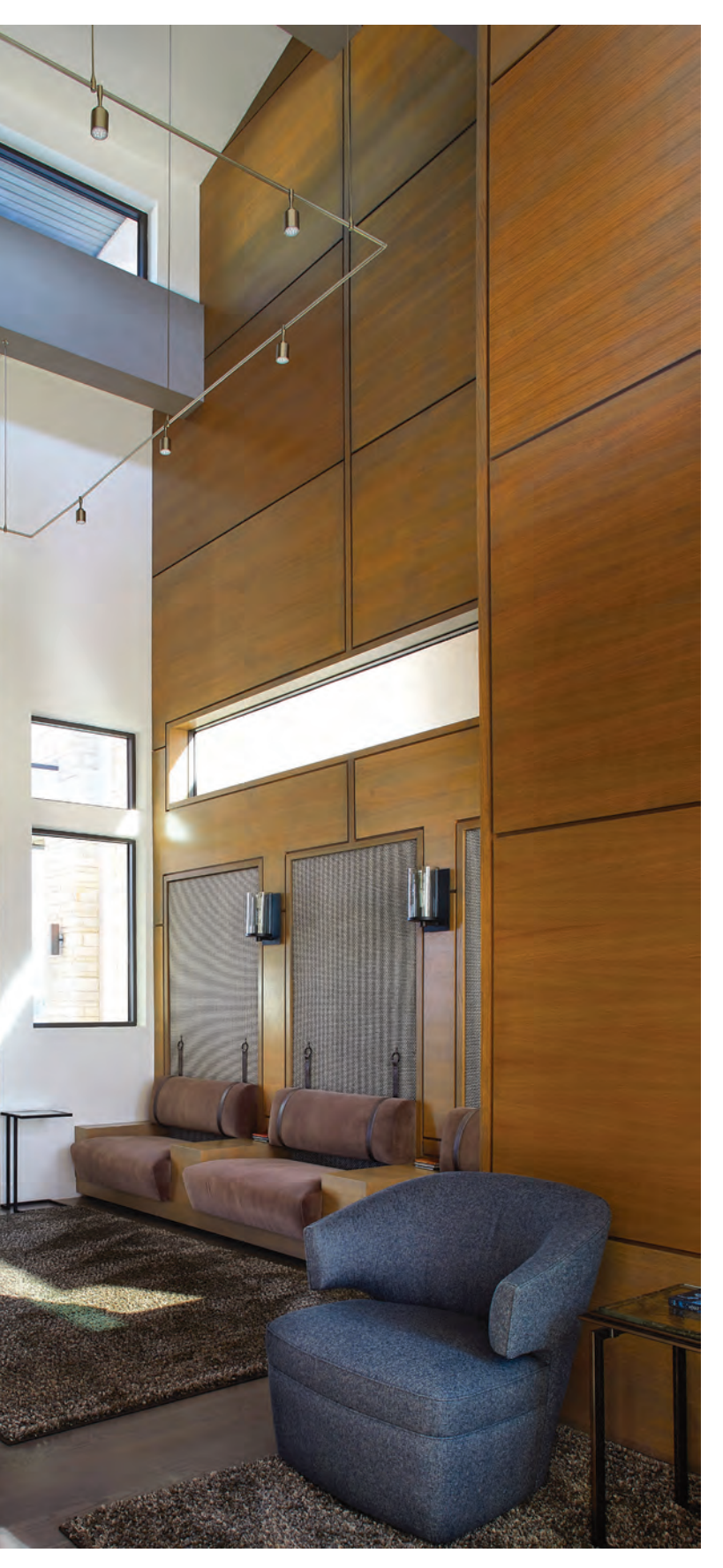
The bar area features rift-cut cerused white oak walls, Donghia Lana club chairs upholstered in Chivasso Giant, 8 in. rift-cut white oak flooring.

in the lakeside seating area. The home has soaring 36-foot-high ceilings, and Summers skillfully selected pieces perfectly scaled for each space. In the bar, she extended fabric up the wall behind a rolled-back custom sofa; in the main living area, a tall marble fireplace, exposed beams, and series of rectangular Pagani lighting fixtures work together to achieve visual balance.