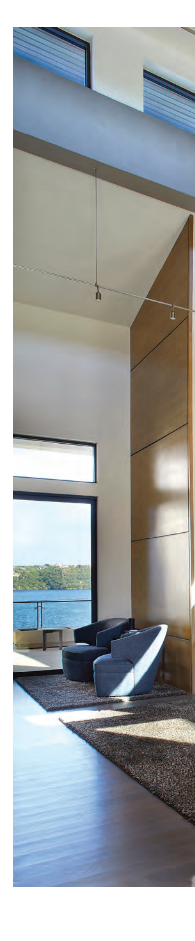
Pagani chandelier; Interior Crafts sofa upholstered in Lee Jofa fabric; custom-bleached mahogany-and-bronze coffee tables by ESDA; Donghia side tables; Clate Grunden table lamps, Rune NYC. Picasso ceramics dot the home.