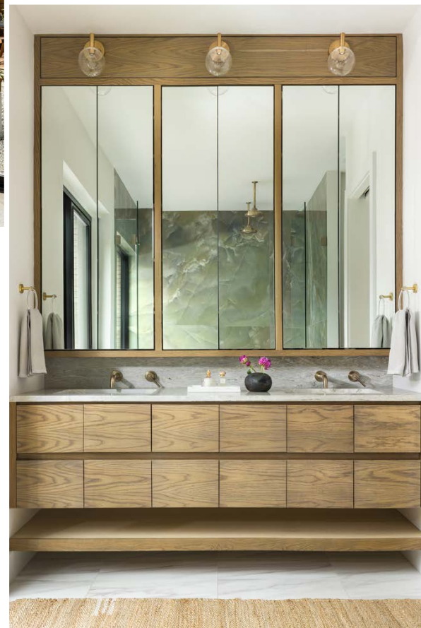
Above: The master suite has an adjoining outdoor space. Top right: The outdoor dining space featuring the two-sided fireplace. Bottom right: A jade stone creates a spa-like experience in the master bathroom.

bath house's first floor has an open-concept kitchen, a master suite with an adjacent home office and dining space accented by herringbone flooring.