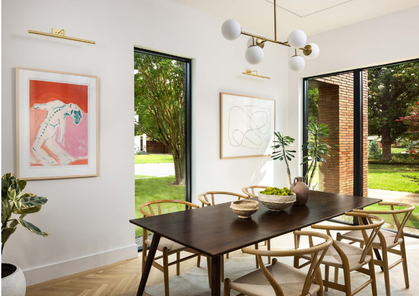
Above: The dining room is in a juttred alcove with a one-story roofline. Right: The half bath on the first floor features the herringbone flooring found in the dining room and contrasting black hardware.