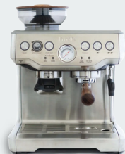
Breville Barista Express ($750/Williams Sonoma)