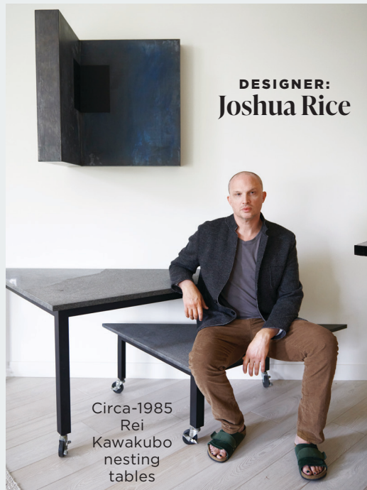
Circa-1985 Rei Kawakubo nesting tables