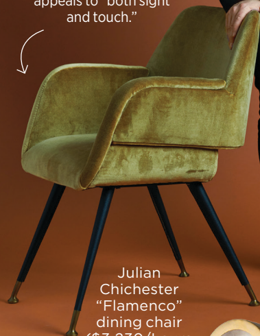
Julian Chichester "Flamenco" dining chair ($3,230/Laura Lee Clark)