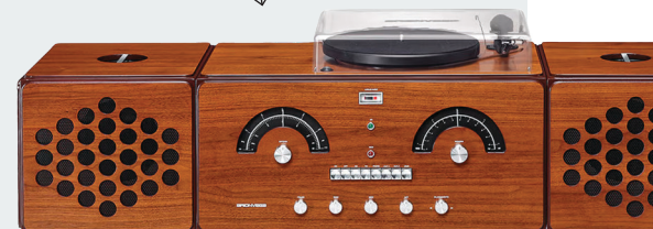
Brionvega Radiofonografo ($23,760/Brionvega.it)

"Turntables and vinyl aren't necessarily a new trend, but based on client requests, they are still going to be going strong well into 2023," says Rice. "There are some great new design-heavy options for audiophiles."