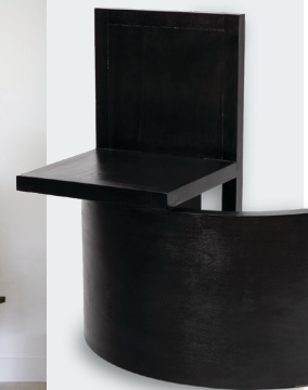
"Sedia No. 75" chair by Paolo Pallucco ($29,421/1stdibs)

Retro redo! Rice loves this modern re-release of a favorite mid-century design