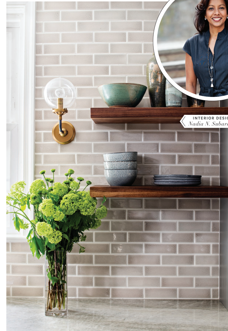
INTERIOR DESIGN Nadia N. Subaran

"Where we really love to have fun and push our budget is on things like cabinet hardware, lighting, and backsplash tile. People fall in love with those little details."