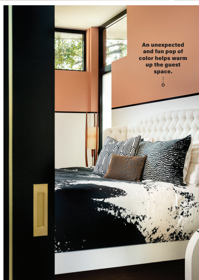
An unexpected and fun pop of color helps warm up the guest space.