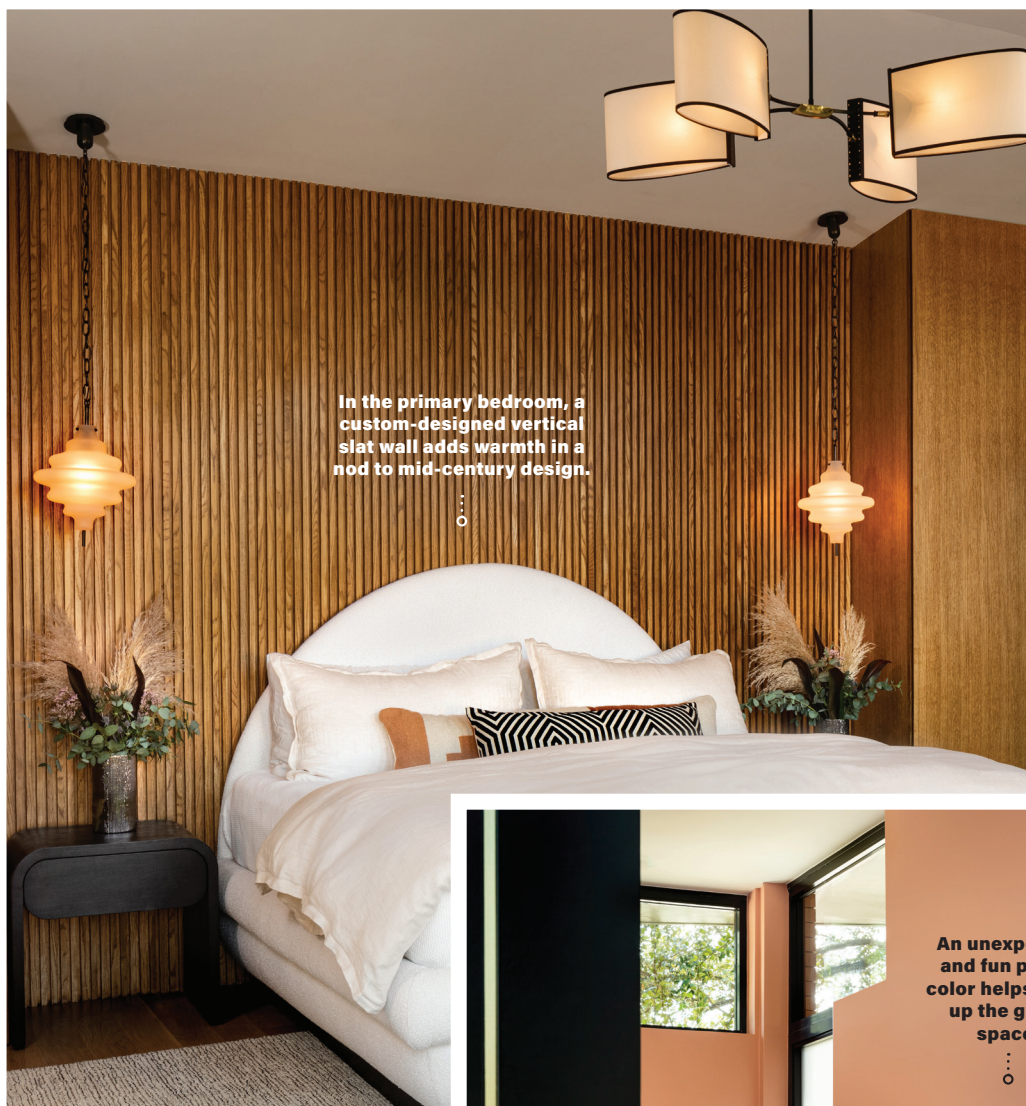
In the primary bedroom, a custom-designed vertical slat wall adds warmth in a nod to mid-century design.