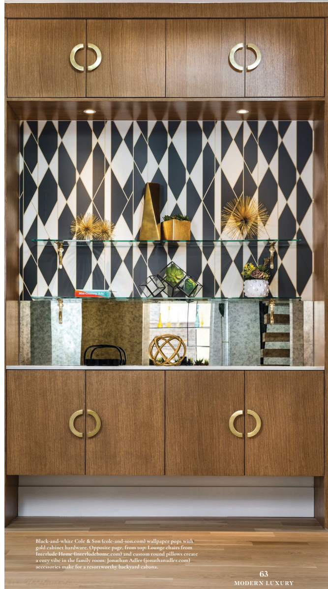
Black-and-white Cole & Son (cole-and-son.com) wallpaper pops with gold cabinet hardware. Opposite page from top: Lounge chairs from Interlude Home (interludehome.com) and custom round pillows create a cozy vibe in the family room; Jonathan Adler (jonathanadler.com) accessories make for a resortworthy backyard cabana.