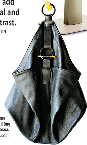
MOSES NADEL Shoreline Wall Bag Leather and brass mosesnadel.com

“As much as I love color, there is something so classic and timeless about a black-and-white design scheme. I'm actually drawn to it in my own spaces. Working with color and taking in so much visual information every day, coming home to a black-and-white space is soothing to me. It's a bit like a gallery, and that's a beautiful way to live, changing your surroundings every now and then and letting your spaces EVOLVE.”