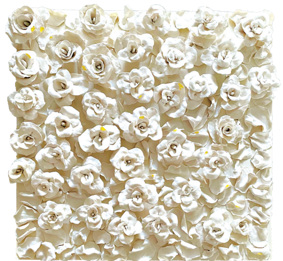
ANNA KASABIAN, #1586, Garden of the Moondance Roses 2' x 2', Hand-formed unglazed roses with Australian porcelain, 23k gold leaf annakasbianporcelain.com