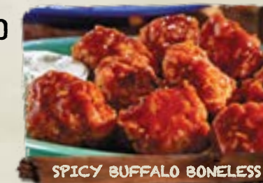
SPICY BUFFALO BONELESS

CALIENTES HOT SMOKY CHIPOTLE JALAPEÑO LIME PINEAPPLE HABANERO MANGO HABANERO