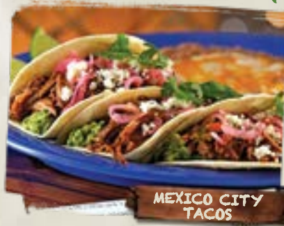
MEXICO CITY TACOS

MEXICO CITY TACOS 15.99 | 1080 cal. Barbacoa, queso fresco, salsa verde, guacamole, habanero onions y cilantro, served with rice y refried beans on flour tortillas