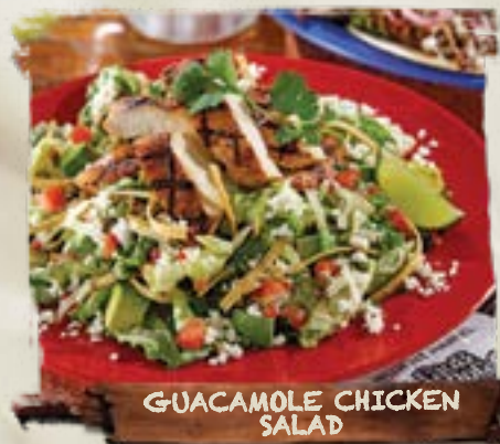
GUACAMOLE CHICKEN SALAD

SOPA DE TORTILLA CUP 5.49 | 330 cal. / BOWL 8.49 | 630 cal. Chicken, veggies, avocado, shredded cheese, serranos y tortilla strips