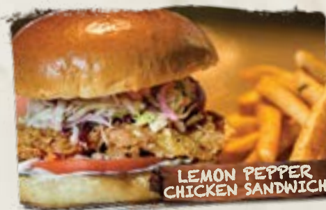
LEMON PEPPER CHICKEN SANDWICH

LEMON PEPPER CHICKEN SANDWICH 13.49 | 1920 cal. Fried chicken breast, lemon pepper sauce, cole slaw, habanero onions, tomato y mayonesa, con fries