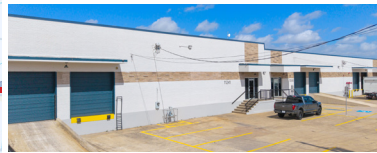
11241 - 11243 LEO LANE