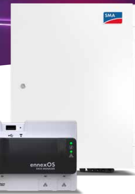
PEAK3 Solution with Inverter, DC Combiner Boxes and ennexOS Data Manager

The PEAK3 system solution is ready for ennexOS, SMA's pioneering digital platform. ennexOS converges the data of all relevant energy sectors to realize modern, forward-looking products in the energy industry. The platform is gradually extended and currently offers powerful features such as satellite-based performance ratio monitoring. Further information: www.ennexos.com