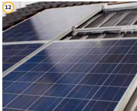
12 Mount the PV modules