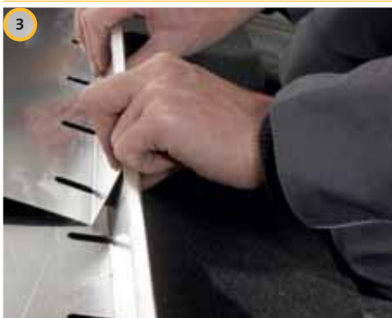
3 Mount the optional gutter LOWER