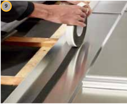
9 Place the sealing tape