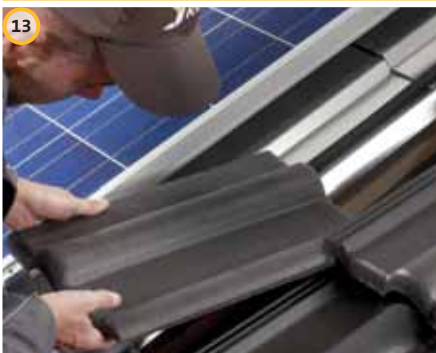
13 Adjust top and side tiles