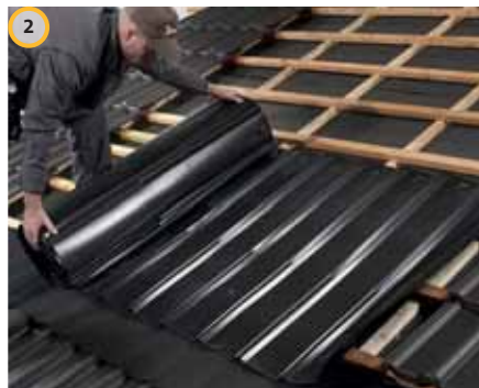
2 Hook the first row of Intersole plates or rolls