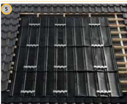
5 Fix the other InterSole plates/rolls with anchors