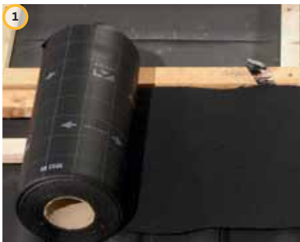
1 Place extra battens and attach a sealing strip