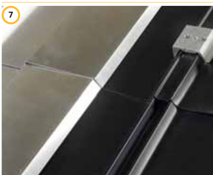
7 Mount the side gutter