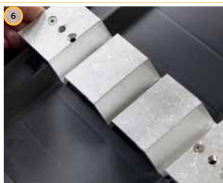
6 Position an optional anchor