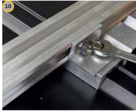
10 Install the mounting rail with brackets