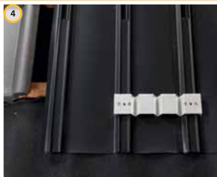
4 Position and screw the anchors