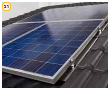
14 InterSole SE