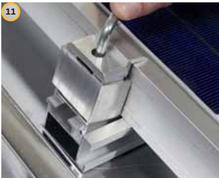
11 Adjust end and middle clamps to the PV module frame and fix them