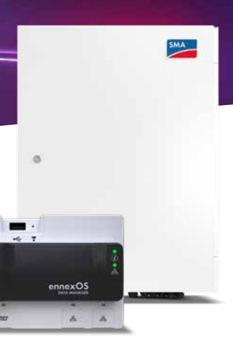
PEAK3 Solution with Inverter, DC Combiner Boxes and ennexOS Data Manager

The PEAK3 system solution is ready for ennexOS, SMA's pioneering digital platform. ennexOS converges the data of all relevant energy sectors to realize modern, forward-looking products in the energy industry. The platform is gradually extended and currently offers powerful features such as satellite-based performance ratio monitoring. Further information: www.ennexos.com