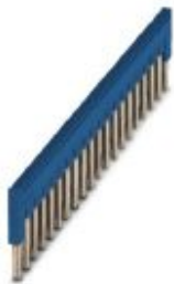
Plug-in bridge, pitch: 4.2 mm, number of positions: 20, color: blue

Please be informed that the data shown in this PDF Document is generated from our Online Catalog. Please find the complete data in the user's documentation. Our General Terms of Use for Downloads are valid ( http://phoenixcontact.com/download )