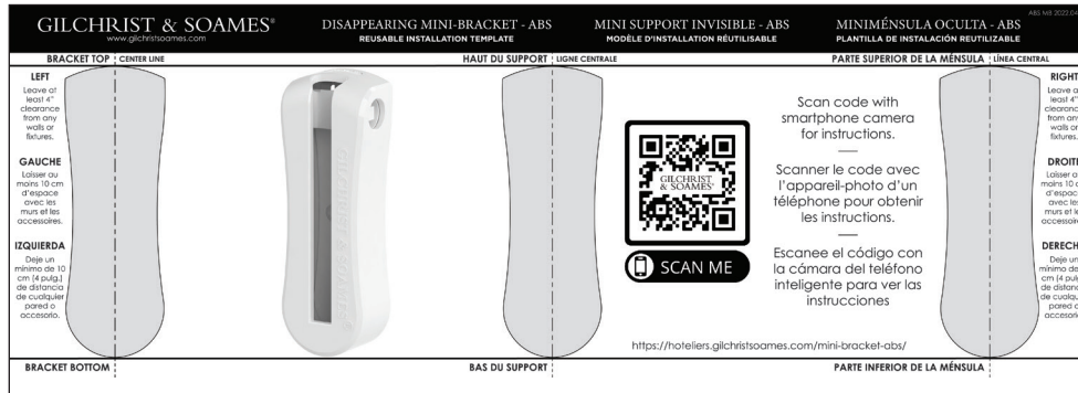
Illustration 1: Reusable Installation Template (included)

Please note bracket center lines and bracket top edge are included to help align brackets to the wall.