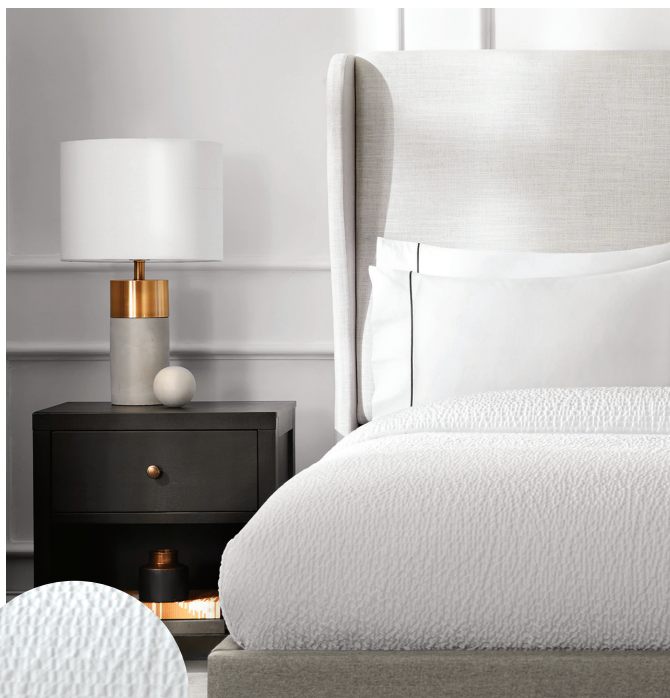
OCEAN WAVES DETAIL

Decorated with a beautifully textured pattern, this top sheet delivers both function and style.