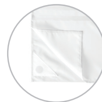
Ultrasonic Hems with Magnets