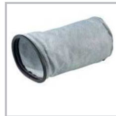
Washable Cloth Bags #HPV-BACK-CLTH BAG