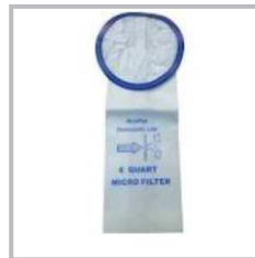
Disposable Paper Vacuum Bags #HPVA005-3