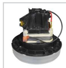
Powerful 1-Stage Motor