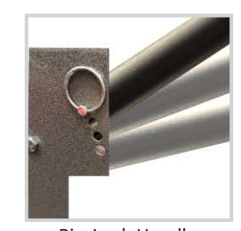
Pin-Lock Handle Adjusts from 33" to 40" High