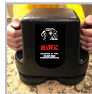
Hand Polishing of Hard Surfaces