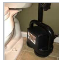
Tight Space Cleaning