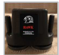
Carpet Spotting and Detail