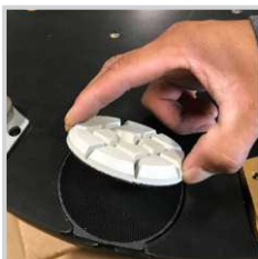
3" Round Resin Tools Mount Fast and Reliably