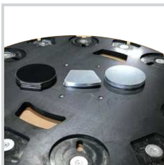
Includes Round Tool Adapters and Metal Hole Blanks to Fit the Milled Recesses