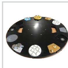
CLAW Drives 3" Round and Trapezoidal Tools